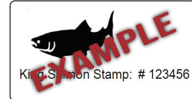
Online king stamp